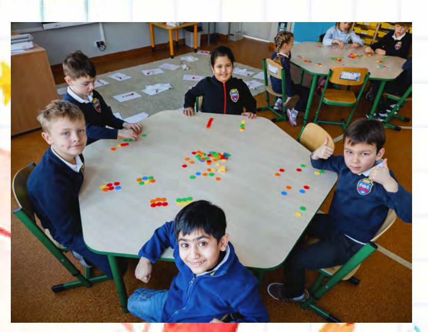
Class 1a counting equal groups of numbers