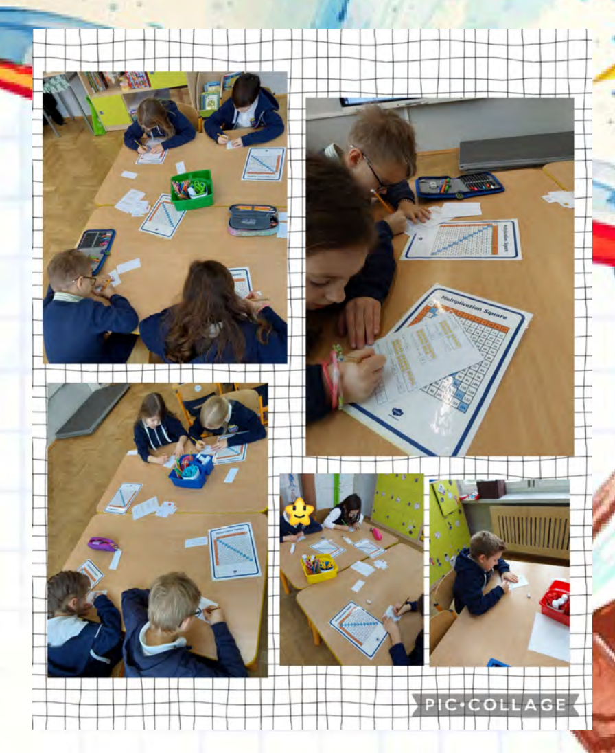
2a students can multiply by 10! :)