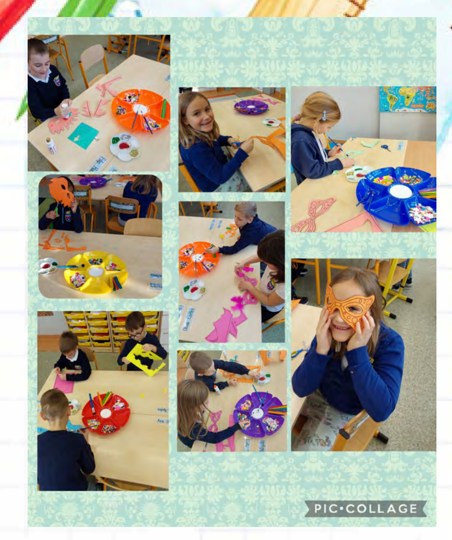
1b students are now all ready for next week's Carnival